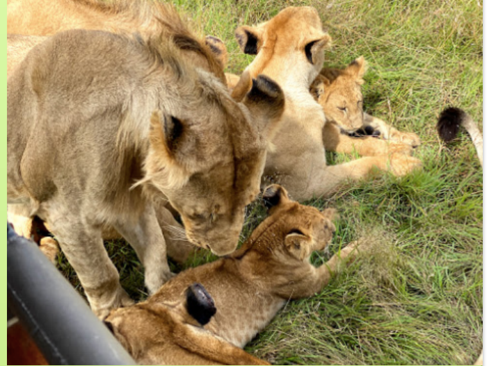
lionesses babysitting a dozen or so